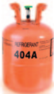
X 4 Series

35% to 50% higher BTU-per- gallon efficiency.