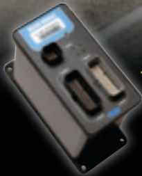
Main Micro Module