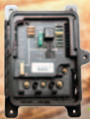
Power Control Module