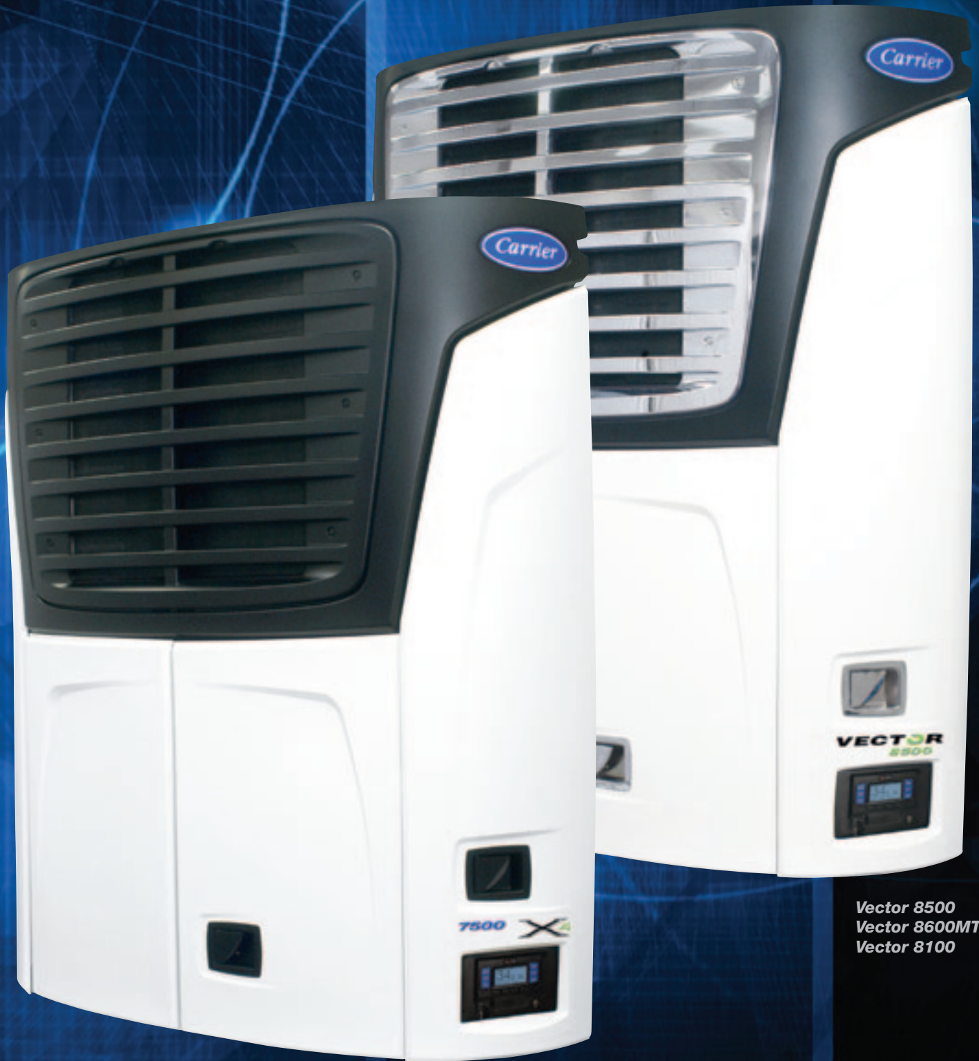
X4 7500 X4 7300